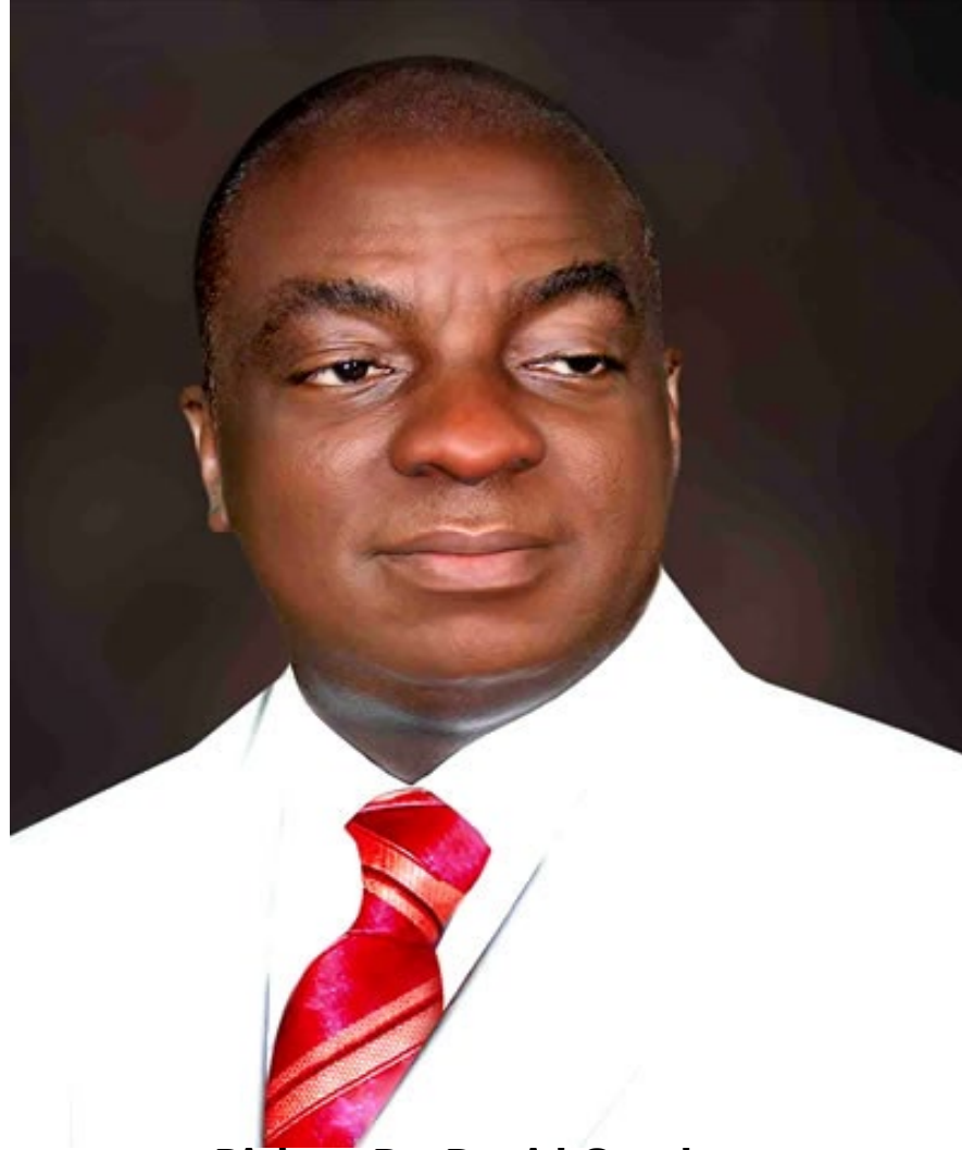
Bishop Dr. David Oyedepo Chancellor, Covenant University